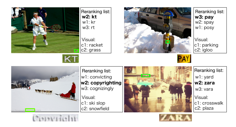
Fig. 3. Some examples of visual context re-ranker. The top-two examples are successful results of the visual context re-ranker. The top-left example is a re-ranking result based on the relation between text and its visuals happen together in the training dataset. The top-right example is a re-ranking result based on semantic relatedness between the text image and its visual. The two cases in the bottom are examples of words either have no semantic correlation with the visual or exist in the training dataset. Not to mention that the top ranking visual c_1 is the most semantically related visual context to the spotted text. (Bold font words indicate the ground truth)

particular domains, with a very low re-training/tuning cost. The proposed post-processing approach can be used as a drop-in complement for any text-spotting algorithm (either deep-learning based or not) that outputs a ranking of word hypotheses. In addition, our approach overcomes some of the limitations that current state-of-the-art deep model struggle to solve in complex background text spotting scenarios, such as short words.