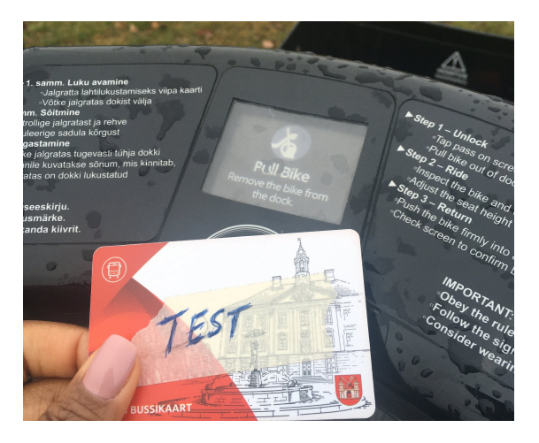
Fig. 10: Successful unlock of bike with Test card

We attempted to unlock the bike by tapping the test card against the bike card reader. This attack was successful (see Figure 10), granting us access to the smart bike and thus confirming the hypotheses mentioned above.