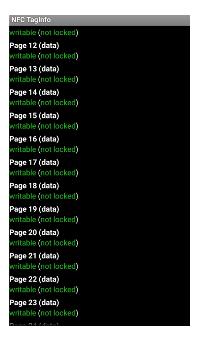
Fig. 7: Access condition for Tartu bus card