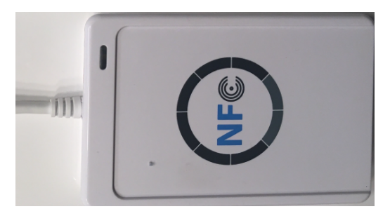
Fig. 8: ACR112U USB NFC reader

A memory dump of the card information was then extracted using the ACR112U USB NFC reader (see Figure 8) and a Python script. The contents of the memory dump were further analysed.