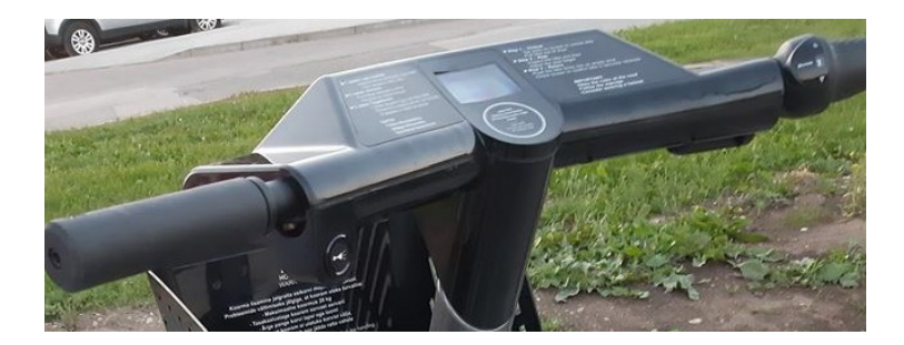
Fig. 5: Smart bike handlebar with built-in NFC card reader (in the center)

high-speed RF communication interface allows the transmission of the data with the bus card.