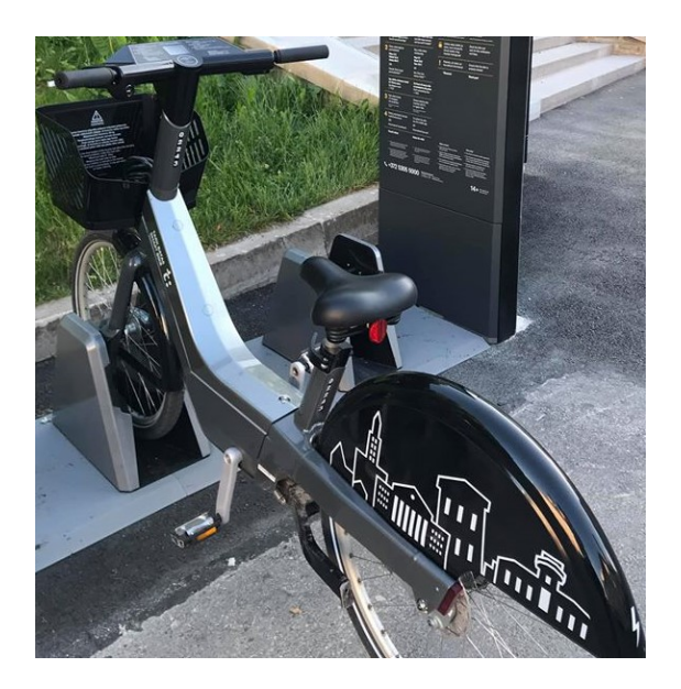
Fig. 1: Tartu smart bike connected to the docking station

The Tartu public transportation system also allows for the use of Tallinn bus cards for validation. As such, a personalised Tallinn bus card with an active ticket can be supplied to unlock the Tartu smart bike successfully. However, we will focus on the Tartu bus card for further analysis. We analyse the Tartu bus card and its interaction with the smart bikes during the unlock procedure to highlight possible vulnerabilities that could lead to possible attacks or attack scenarios and provide possible solutions.