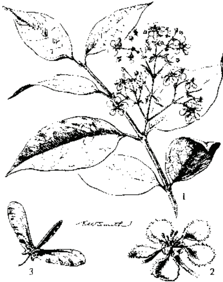
Figure 1: Banisteriopsis caapi (Schultes and Hofmann 1980:164)