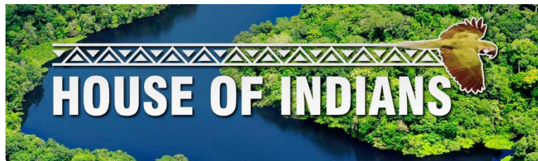
Figure 21: the logo of House of Indians

peoples. Besides the strictly ecological and technological aspects of their work, the statutes of House of Indians mention they wish to “preserve and promote the culture and