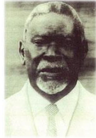
Figure 9: Raimundo Irineu Serra