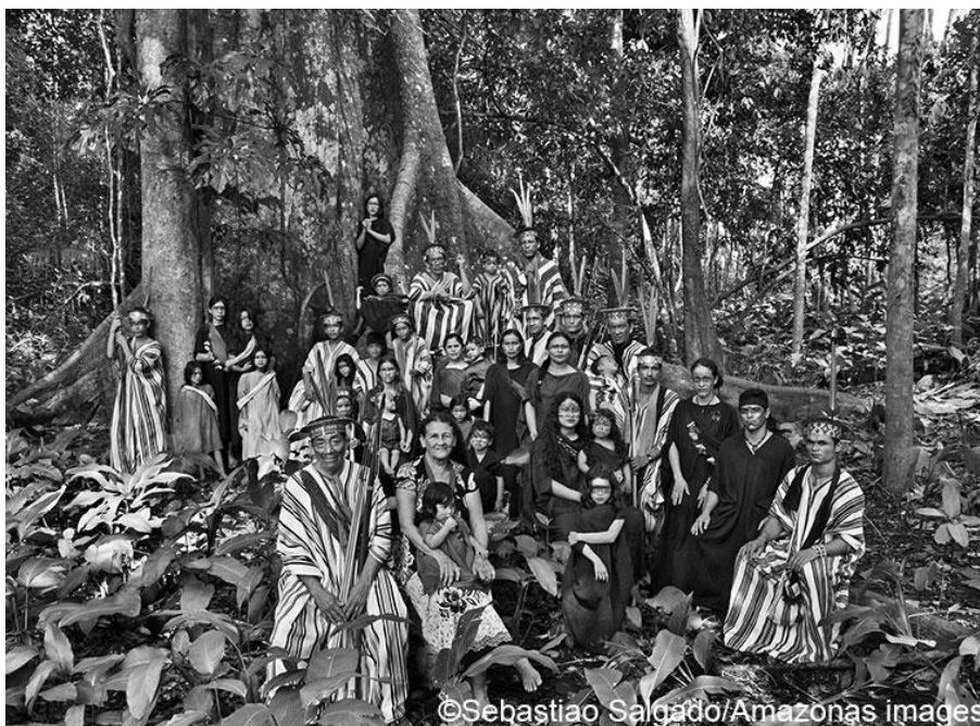
Figure 10: The Ashaninka of the Amônia river