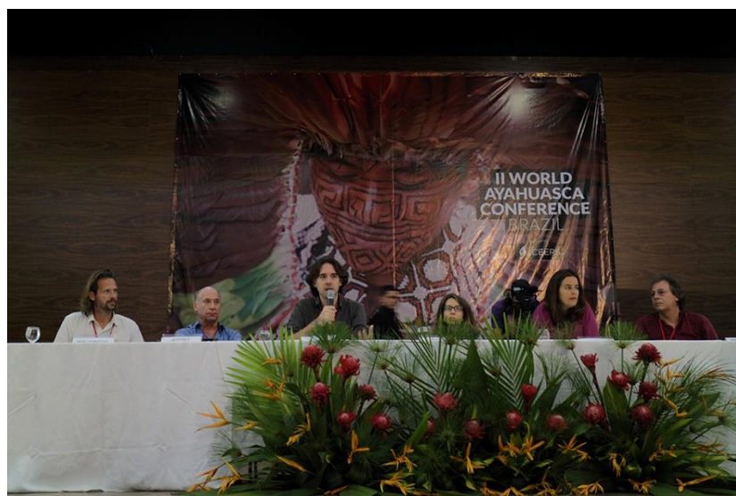
Figure 16: Prominent scholars, researchers and specialists discussing the question "of who is ayahuasca?"