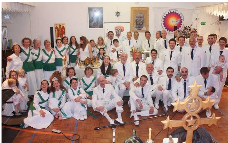
Figure 18: Group foto of Casa de Cura Mestre Irineu (CdCMI)