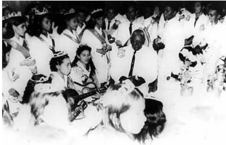
Figure 11: Mestre Irineu during a Santo Daime ritual in "Alto Santo"

In the book of Moreira and MacRae it becomes further clear that, even though outbreaks of