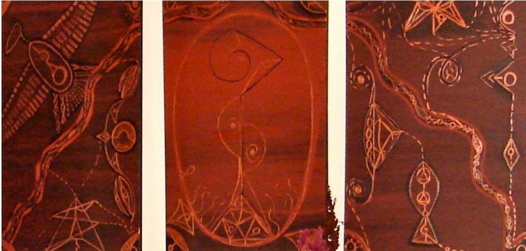
Figure E2. Photography of Creative Synthesis No. 2, (2012), by Yalila Espinoza.