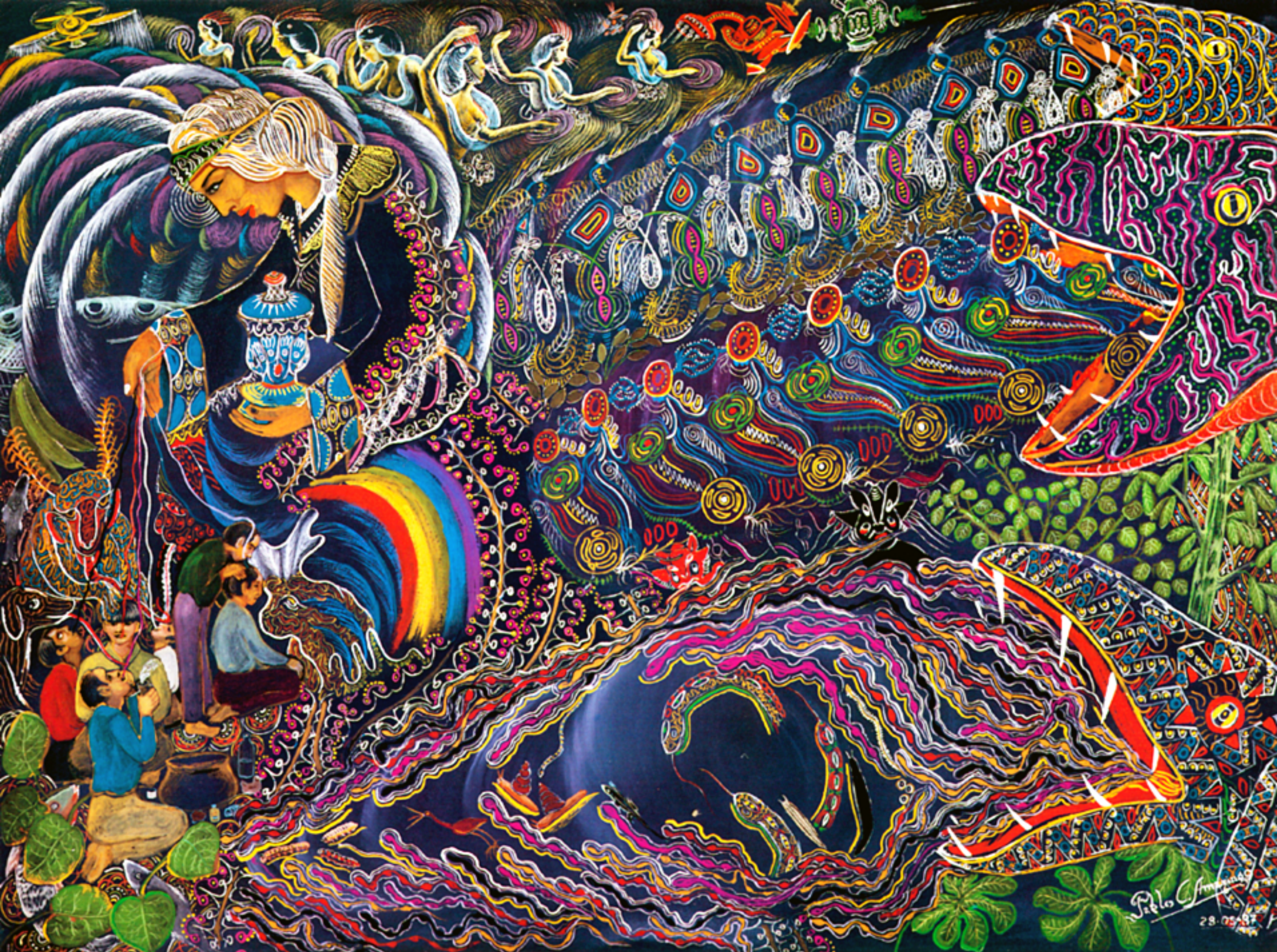
The Power of the Mariris, by Pablo Amaringo, 1987