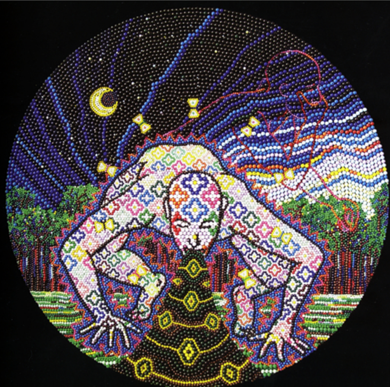
Banisteriopsis caapi 2