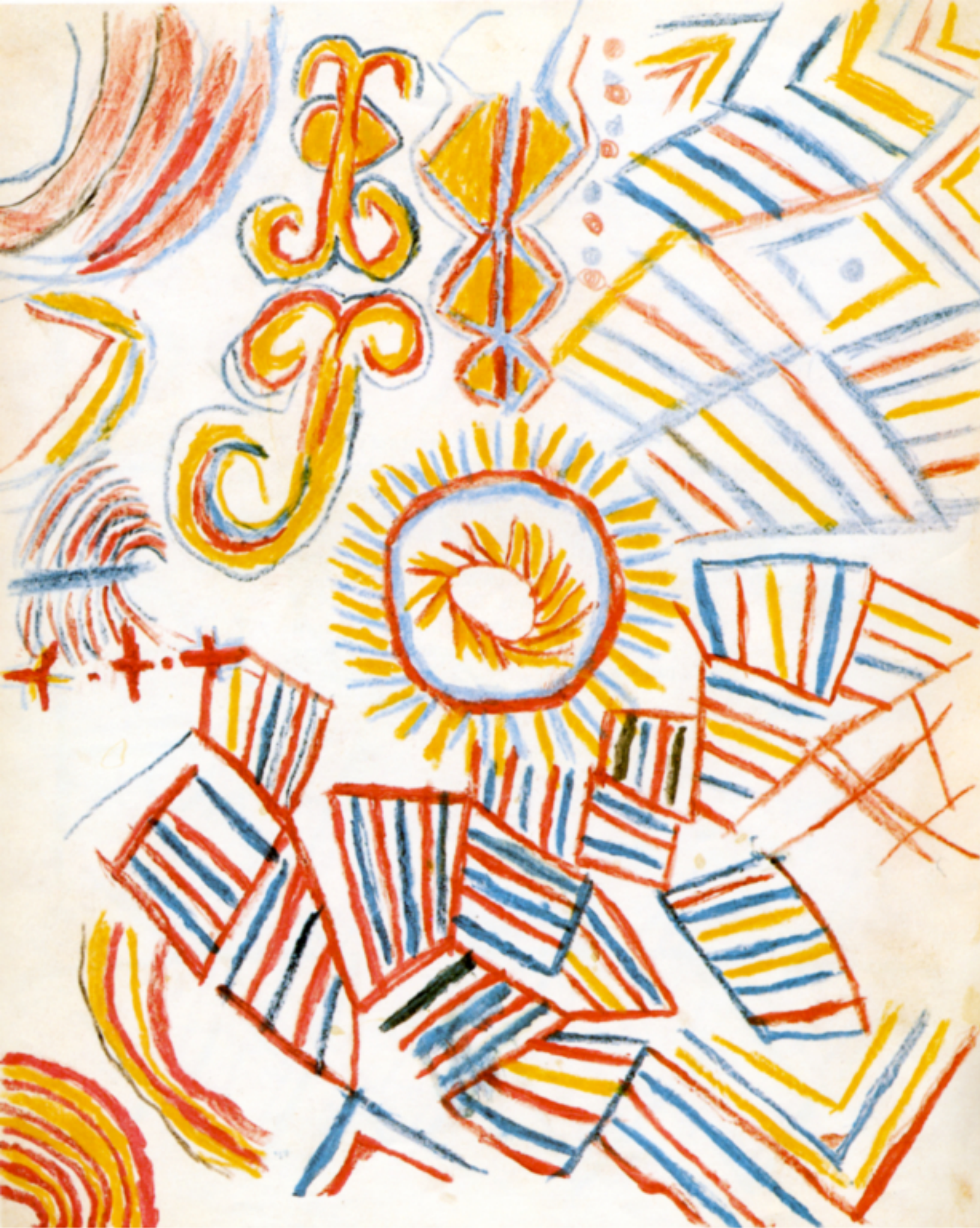
Scene of cosmic fertility, Biá, Tatuyo