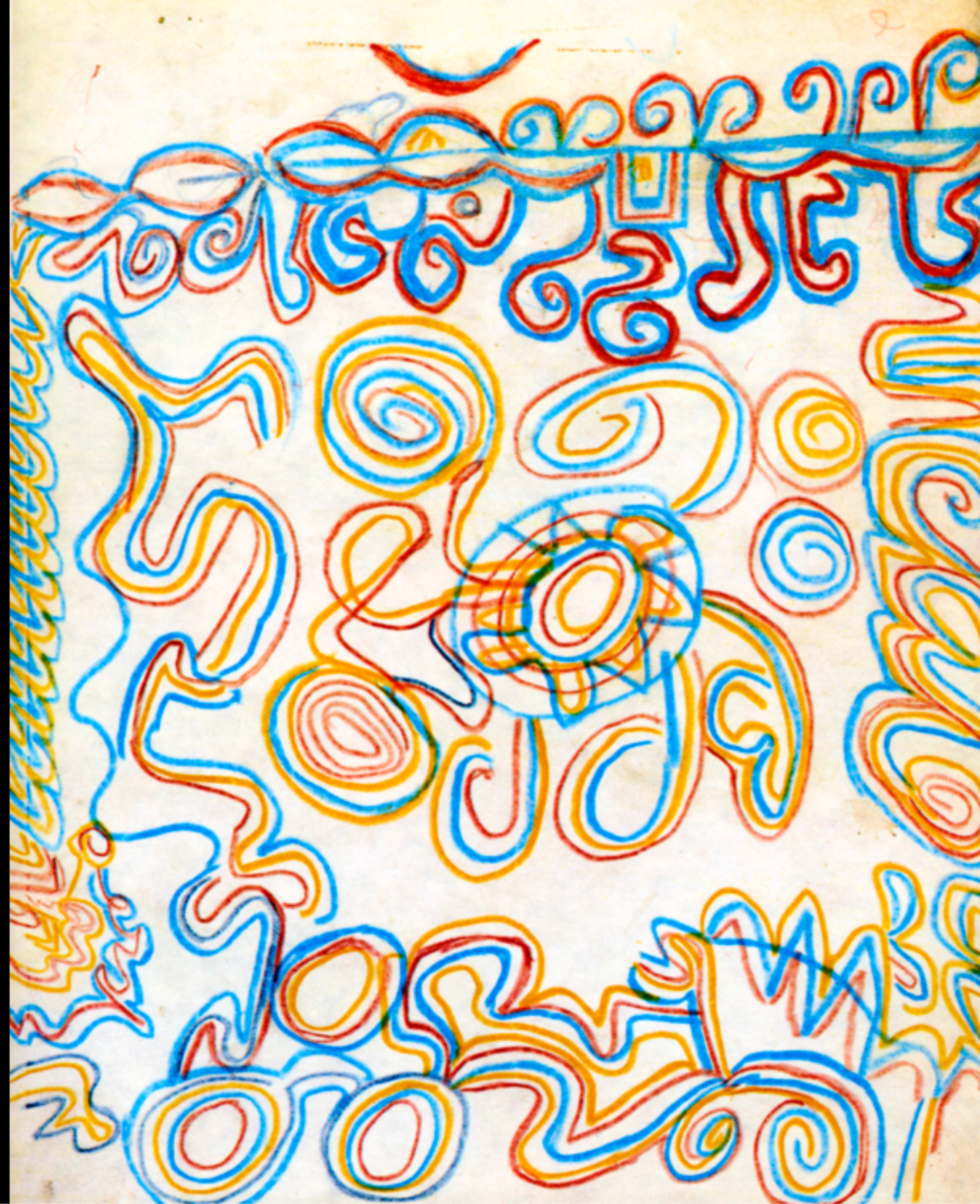
The Sun surrounded by songs and things one sees, by Yamí, southern Barasana

Tukano paintings, 1960's Vaupés, Colombia