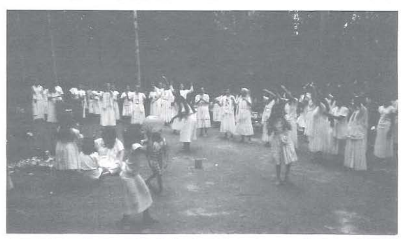
Figure 2. Umbanda ceremony, Céu do Mapía, Brazil

fied her with the Virgin Mary. The woman told him to enter the rainforest alone to prepare and drink the ayahuasca brew for eight days. Subsequent instructions were to spread her message throughout the world. Ayahuasca was to be called daime (i.e., "give me," as in "give me love, give me light, give me strength"), because the