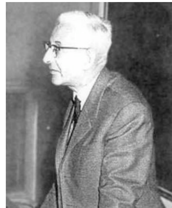
Heyting Intuitionistic logic